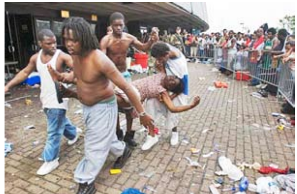
After Katrina, at the Superdome.

dow, and sucked air through his teeth. Perhaps this was a regional thing, but the blacks often sucked air through their teeth as a wordless expression of disdain or hostility.